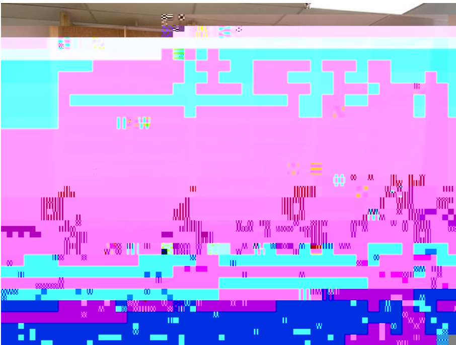
Classroom Millwork progressing